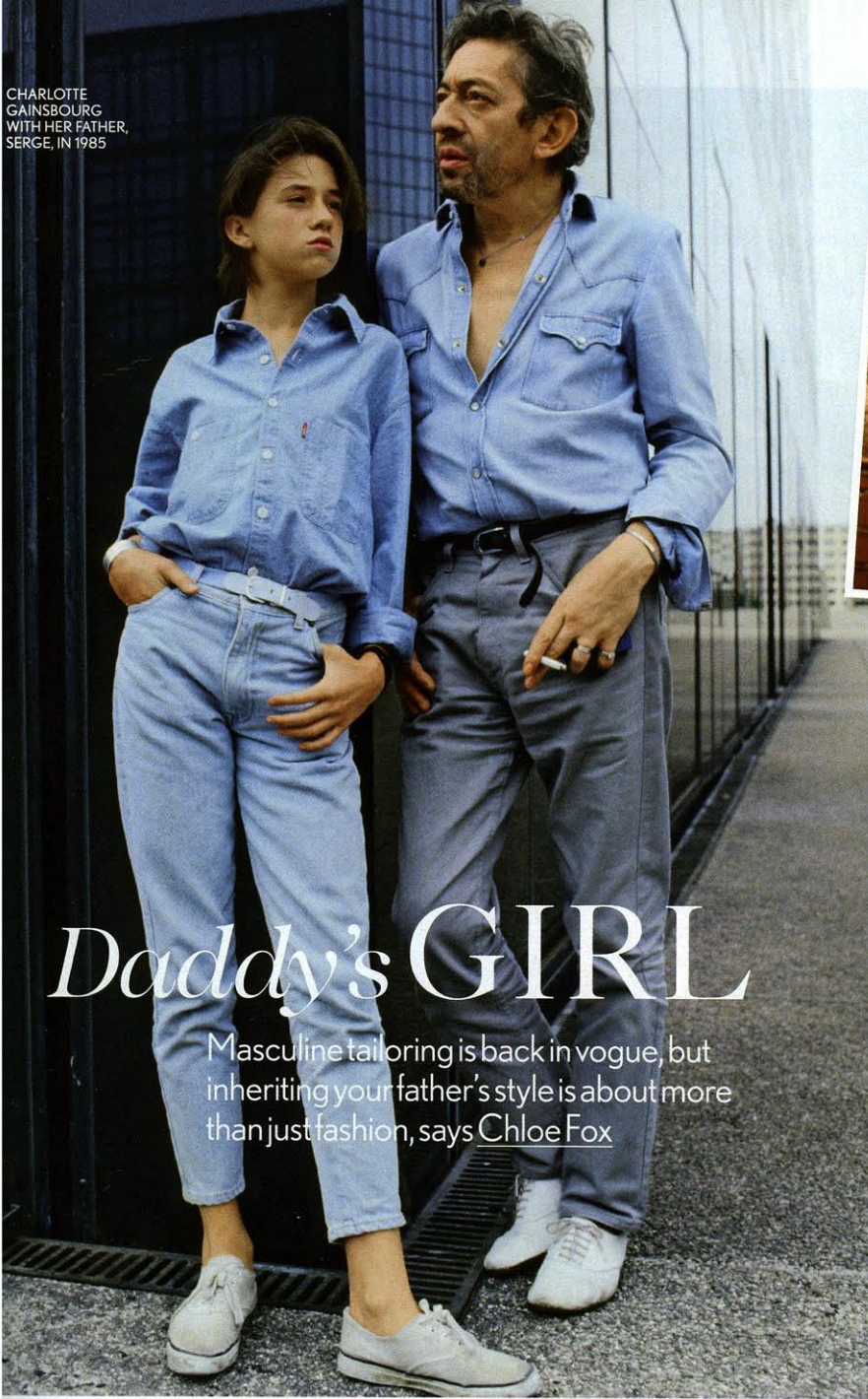
CHARLOTTE GAINSBOURG WITH HER FATHER, SERGE, IN 1985